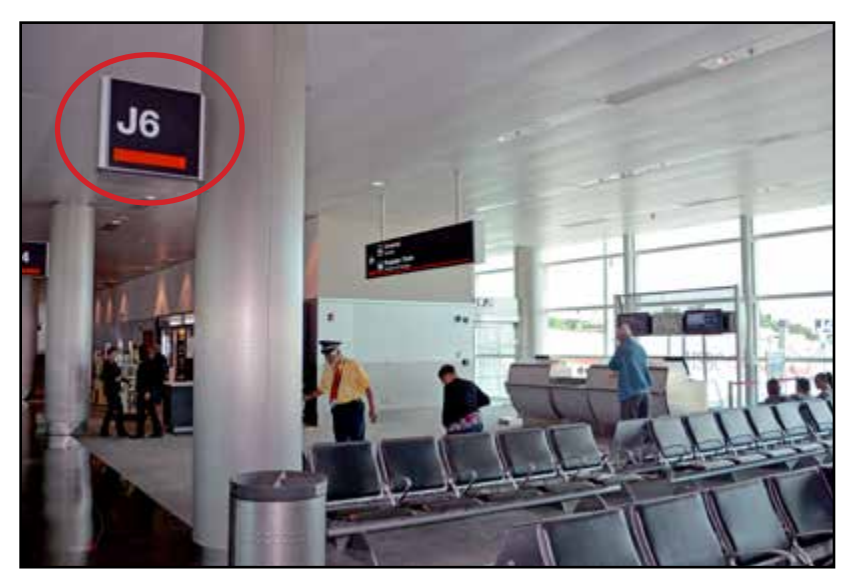
Then, I will walk to the gate.