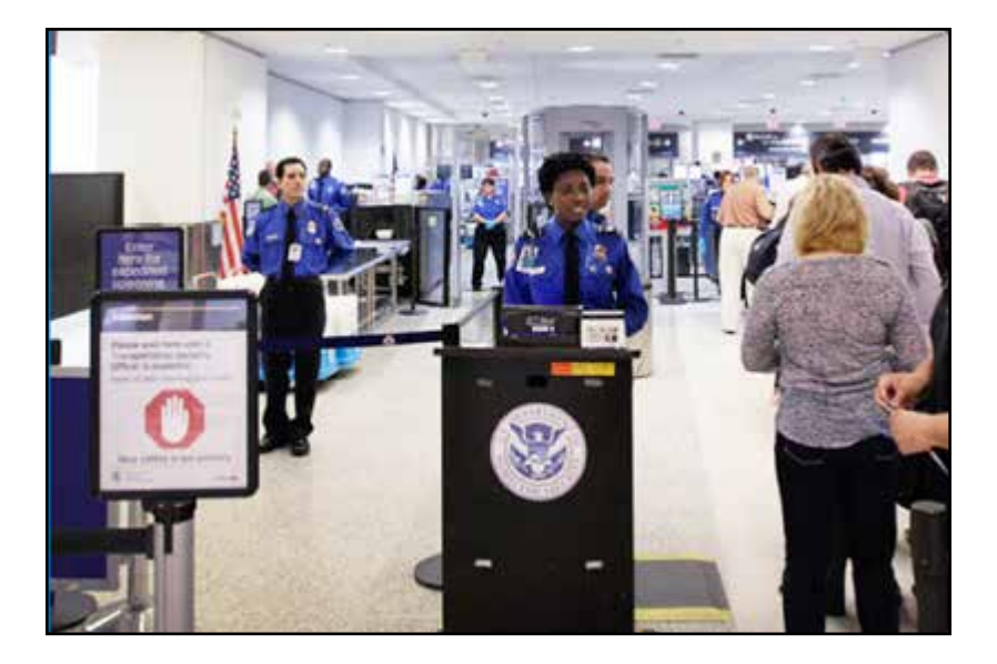
Then, I will wait in line to go through security.